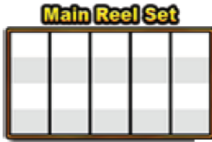
MAIN REEL SET 5 X 4